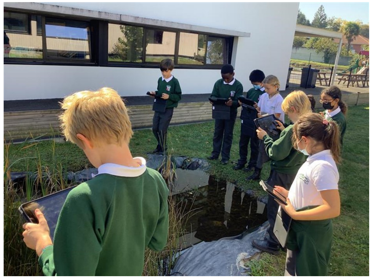
Grade 5 investigate life-cycles during Science