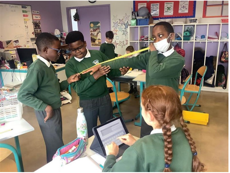
Grade 6 investigate the mean-average during a Maths lesson