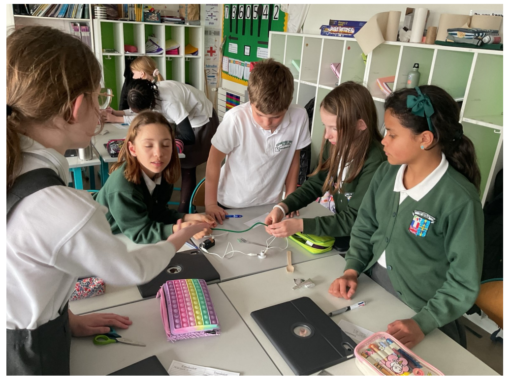
Grade 6 investigate electrical circuits during a Science lesson

The school cannot accept responsibility for toys that are lost or damaged.