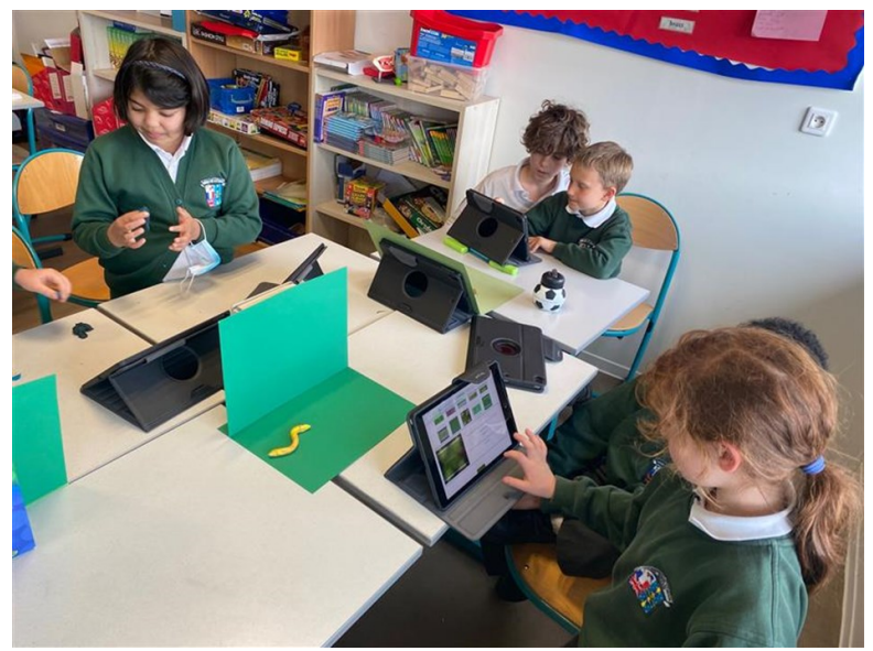
Grade 4 Computing - Stop-motion animation using 'green-screens'