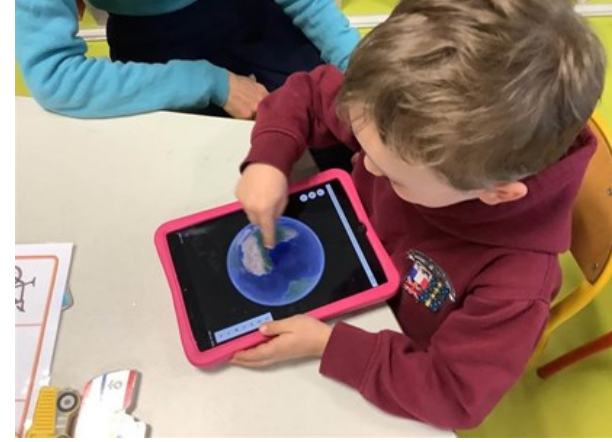
Reception Class discover and explore maps, using Google Earth, as a part of their 'Journeys' topic