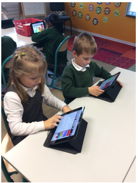
Grade 2 Computing - 'Spreadsheets'

Parents are encouraged to visit these sites on a regular basis as they will be able to keep in touch with the different learning taking place through photos, accounts and interactive activities for them to do with their children.