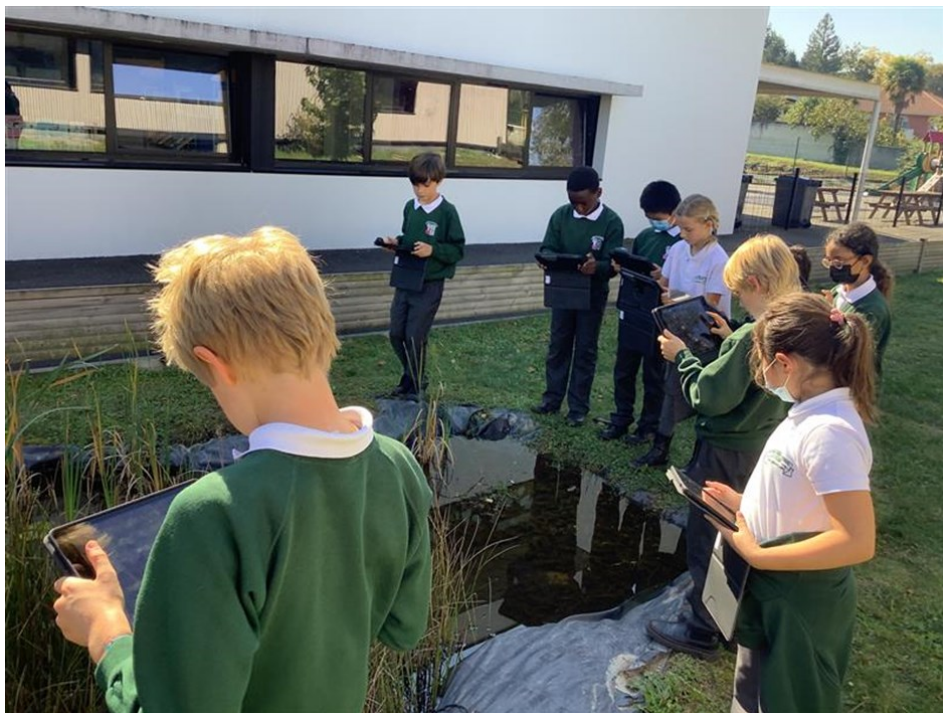
Grade 5 investigate life-cycles during Science