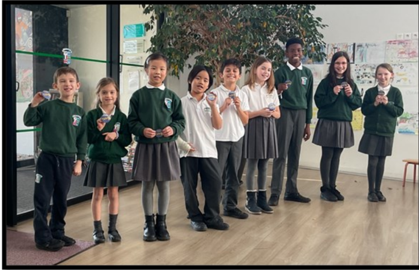
The new student councilors receive their badges during assembly

Please note that children with a temperature or who have vomited or are known to have diarrhoea, should not come to school for at least 48 hours . If your child has a rash, please obtain a medical certificate confirming that there is no risk of contagion before bringing them to school.