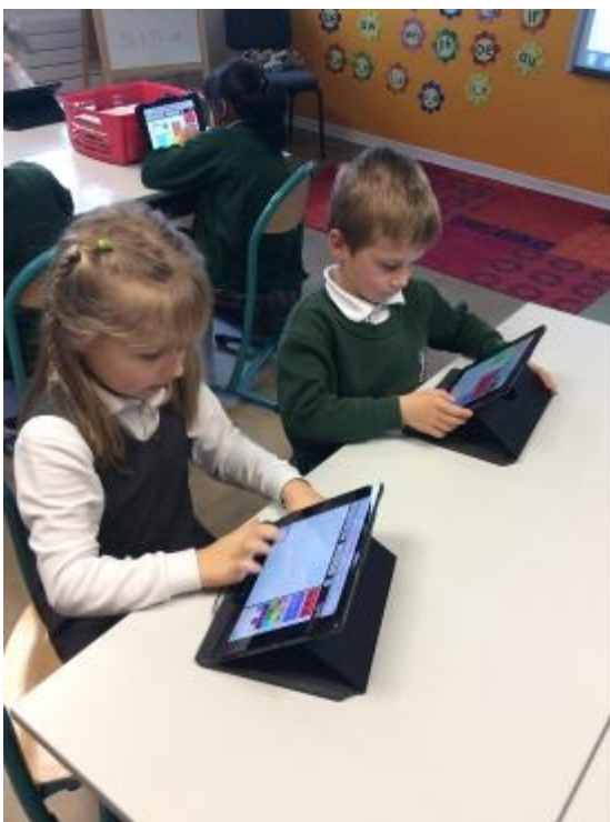
Grade 2 Computing - 'Spreadsheets'