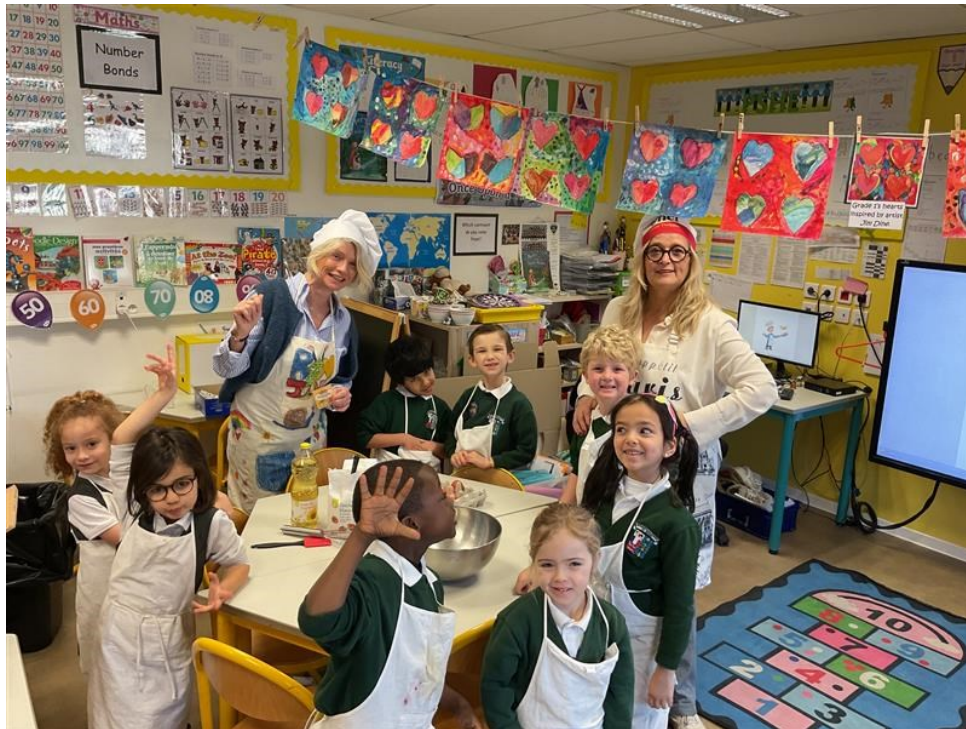
Grade 1 make crepes during French

The school cannot accept responsibility for toys that are lost or damaged.