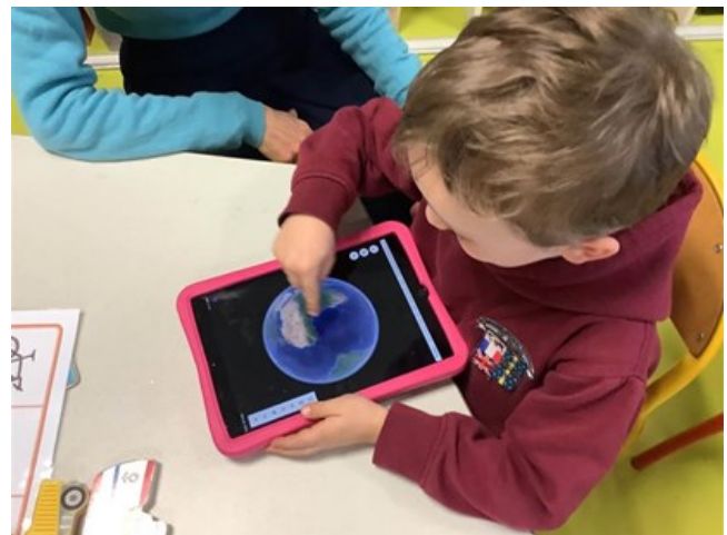
Reception Class discover and explore maps, using Google Earth , as a part of their 'Journeys' topic