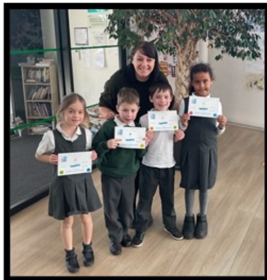
Grade 2 students receive their merit certificates

The school is not obliged to administer medicine, but we do recognise that asking parents to come to school to administer a prescribed dose is not always realistic. If you need to request your child's class teacher to administer medicine during the school day, please provide the teacher with a doctor's certificate and any relevant instructions re administering the medication.