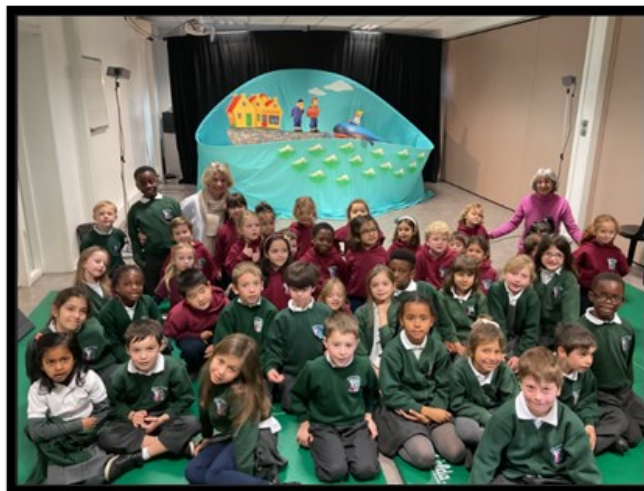
A visit from Les Trois Chardons theatre company