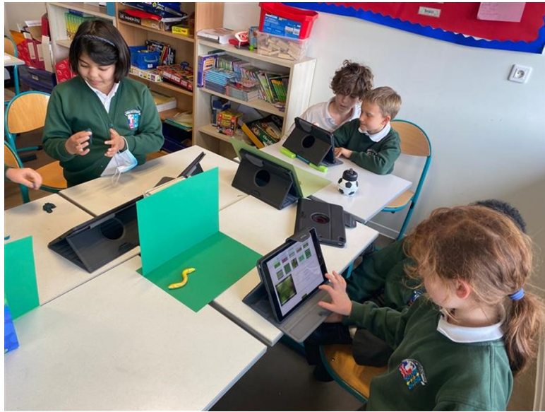
Grade 4 Computing - Stop-motion animation using 'green-screens'